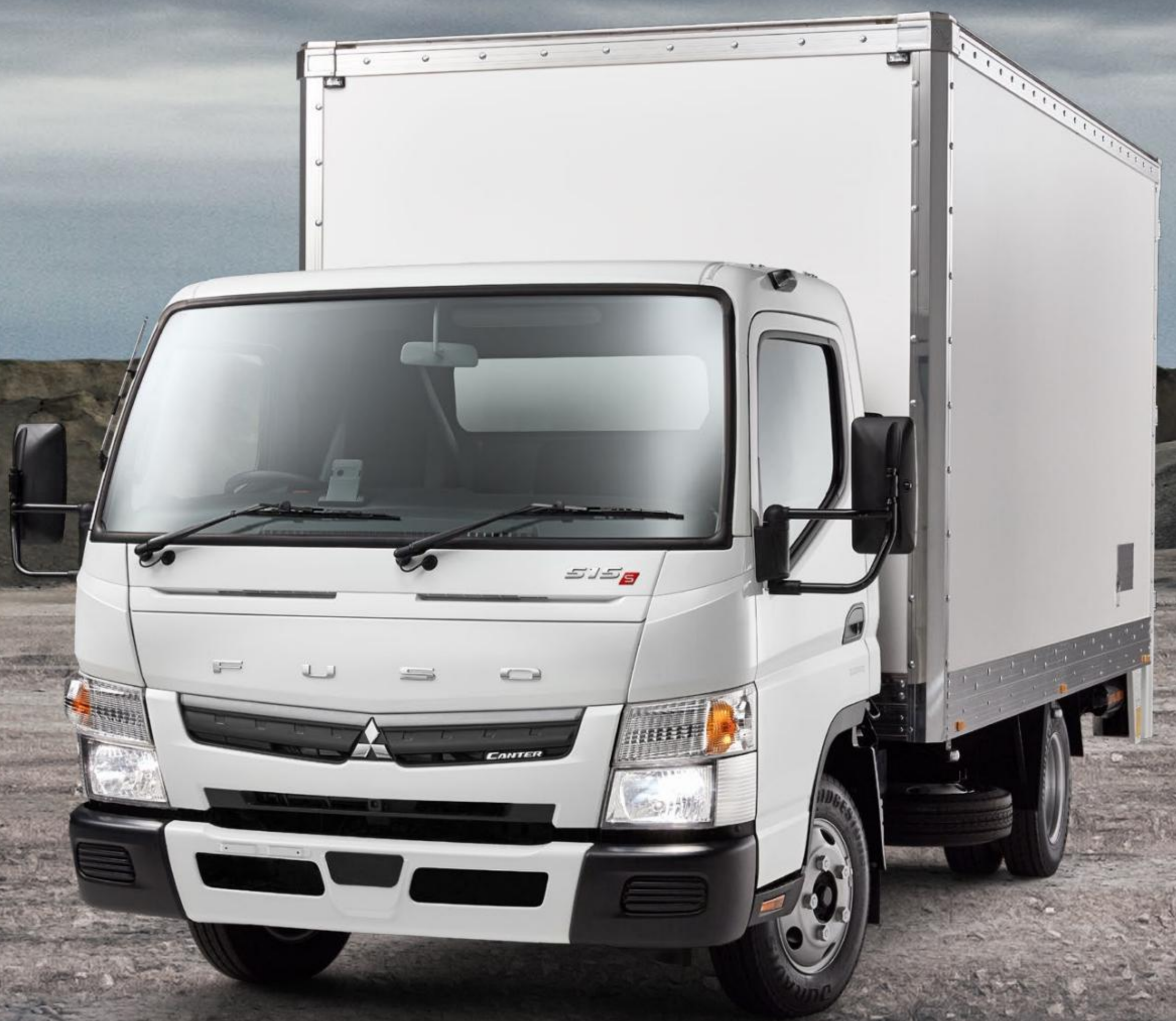
CANTER 515 - PANTECH

GOT A JOB TOMORROW AND NEED A TRUCK TODAY?