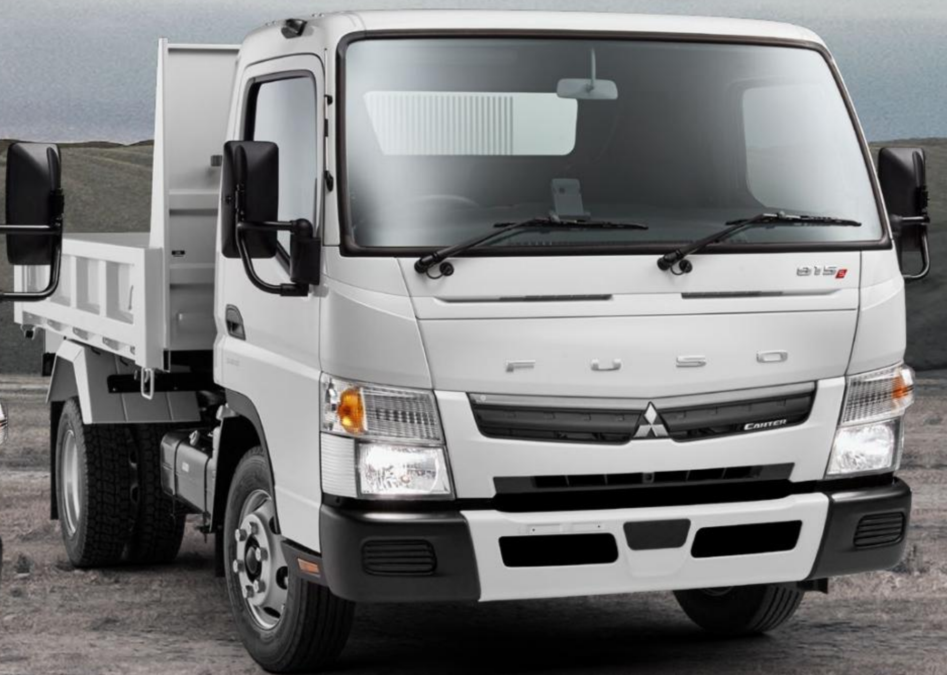
CANTER 815 - TIPPER

Maybe you need a City Cab for narrow access, or our best-selling Wide Cab to seat 3 across in comfort? Got a big crew? Try our Crew Cab that seats 7 with ease, complete with dual zone Air-Conditioning. Or maybe you're looking for a cab that loves to limbo through car parks and basements; then our Super Low Cab will get the job done, no dramas.