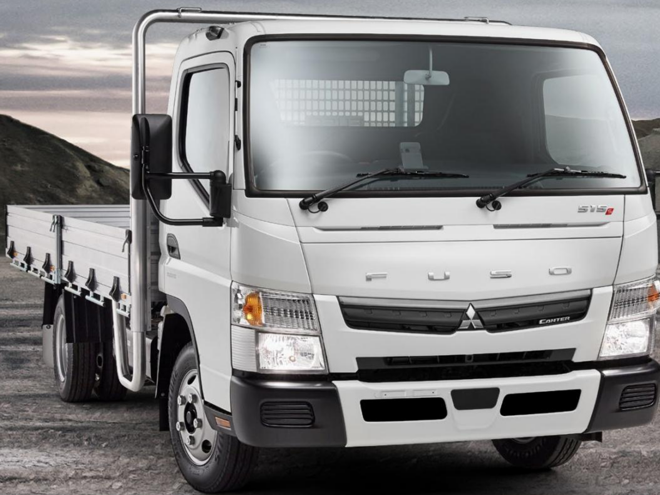
CANTER 515 - ALLOY TRAY