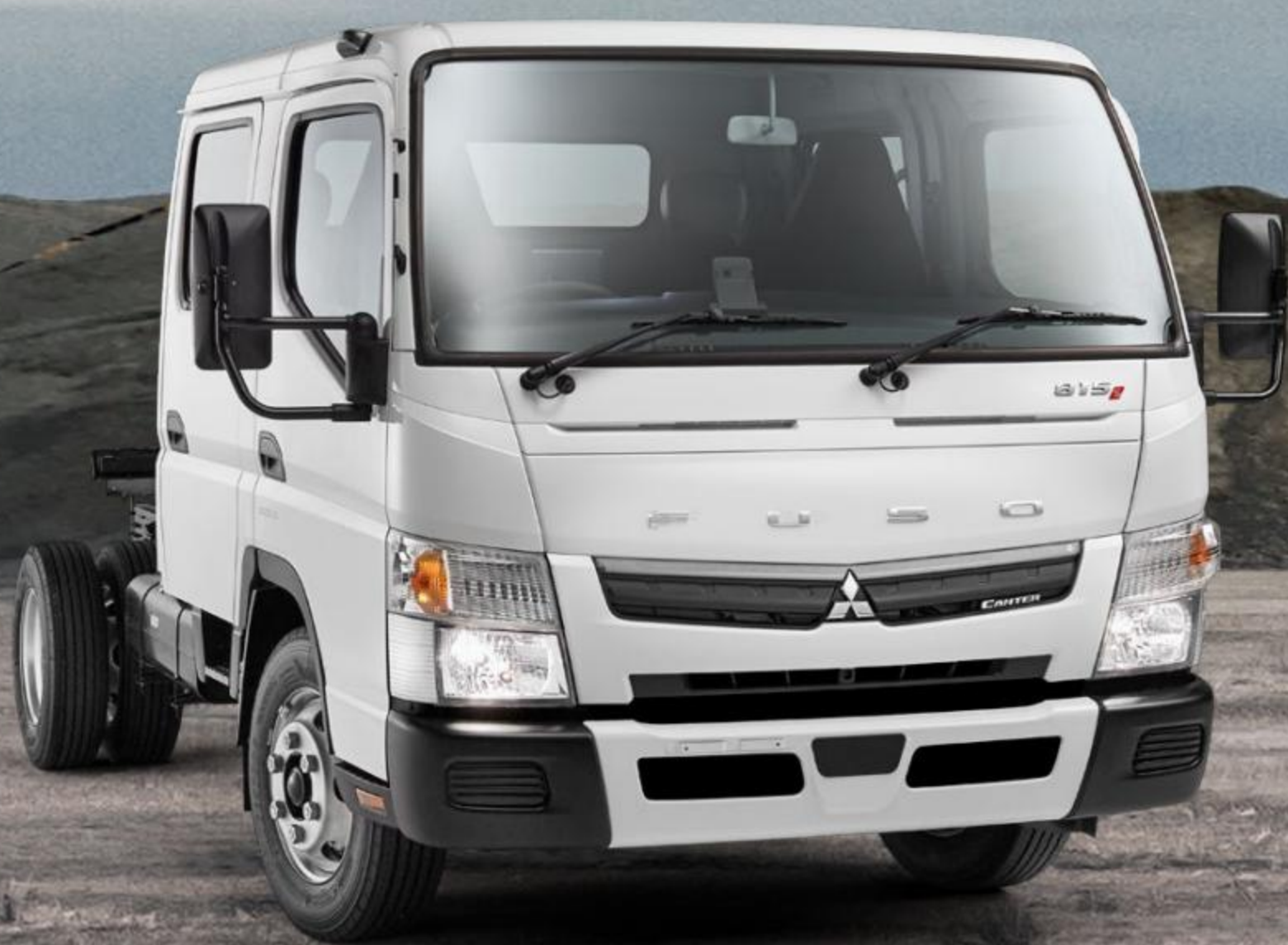
CANTER 815 - CREW CAB

SHOW US THE CHALLENGE AND WE WILL SHOW YOU THE CANTER TO CONQUER IT